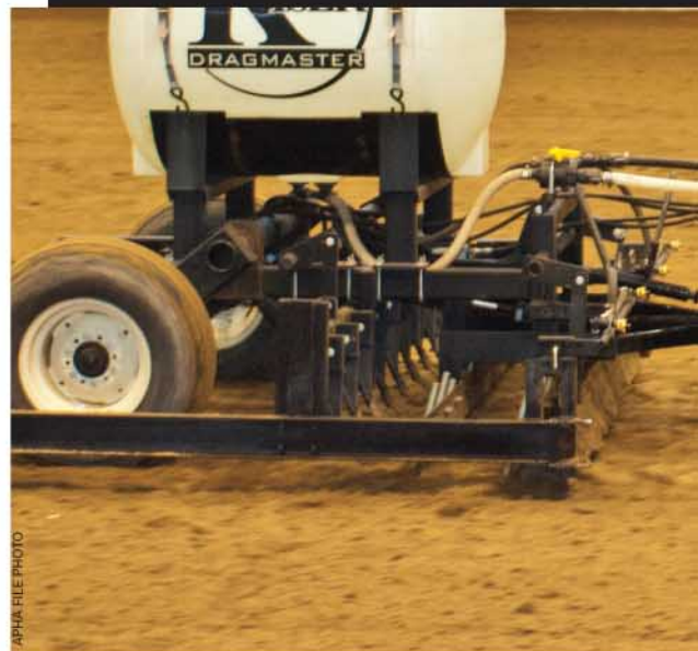
APHA FILE PHOTO